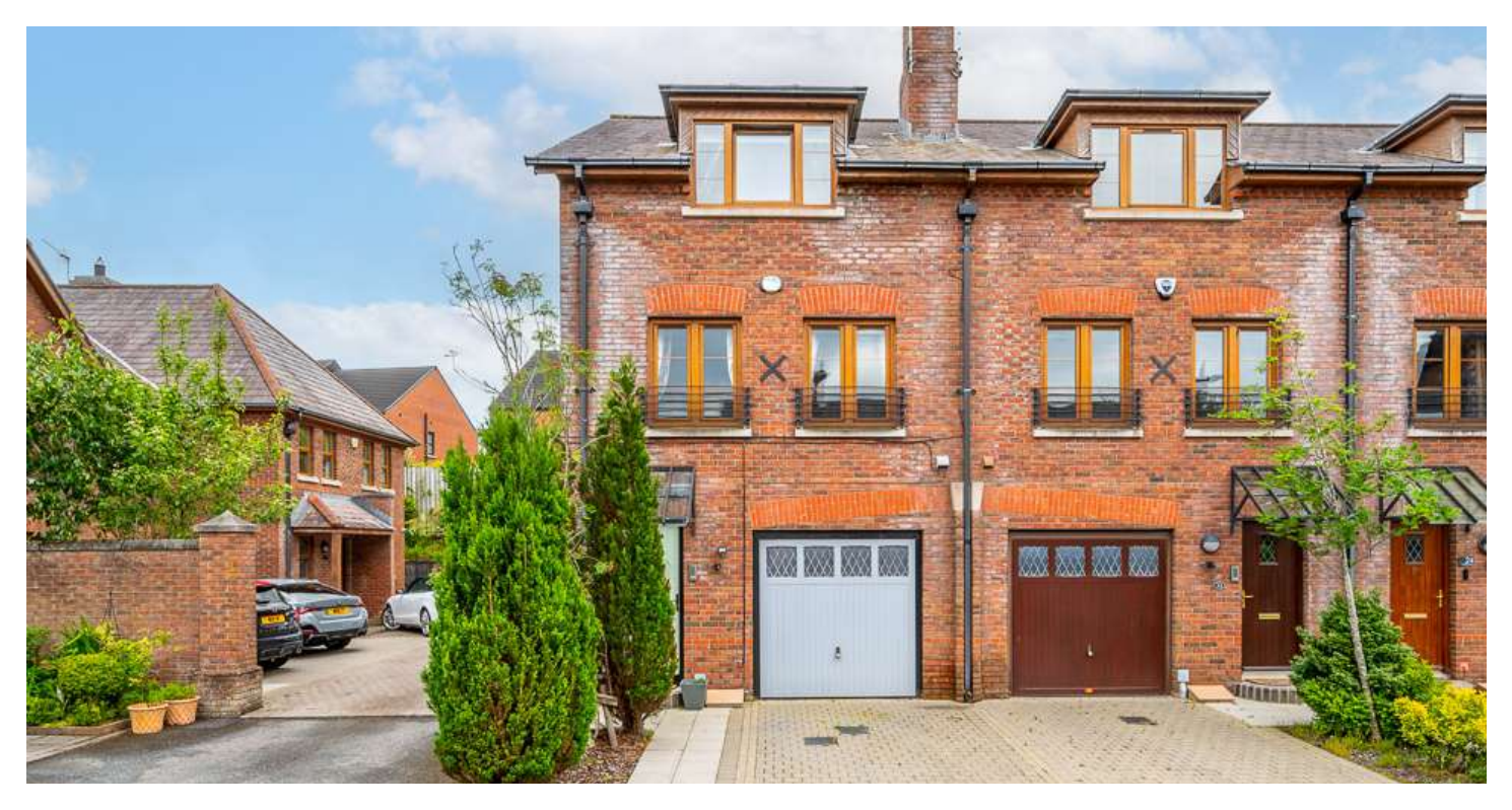
END TOWNHOUSE | 3 ⊨ | 3 ≒ | 2 ⊟

We are delighted to bring to the market this attractive three bedroom end townhouse off Ballygowan Road in East Belfast.