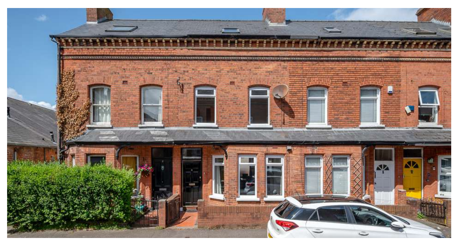
MID TERRACE | 4 ⊨ | 1 ≒ | 1 ⊟

Located off the prestigious Belmont Road in East Belfast, 4 Ferguson Drive is a fantastically appointed four-bedroom mid-townhouse.